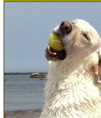
Henry in his beach glory! This is the life!

Several photos will be chosen by the newsletter staff and featured on the Labs4rescue Facebook group page for voting: https://www.facebook.com/groups/44758133480/