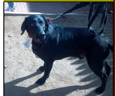
Bentley - Glastonbury, CT