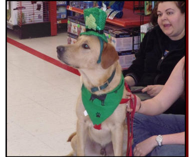
Dash - Wallingford, CT