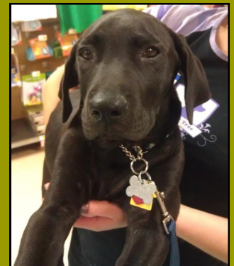
Pumpernickel- Clinton, CT