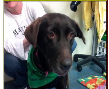
Hazel #7 - Manchester, CT