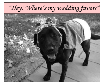
"Hey! Where's my wedding favor?"

Every little bit counts towards helping Labs in need.