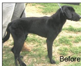
Slick before rescue