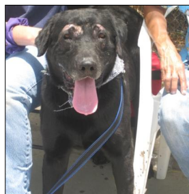
Big Boy a.k.a. Buddy before adoption